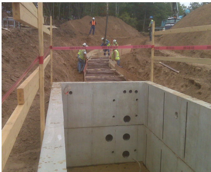
Working on an underground line in a typical 8' x 8' x 24' vault

When an electric utility considers whether or not to construct high-voltage transmission facilities, it must evaluate the following considerations: